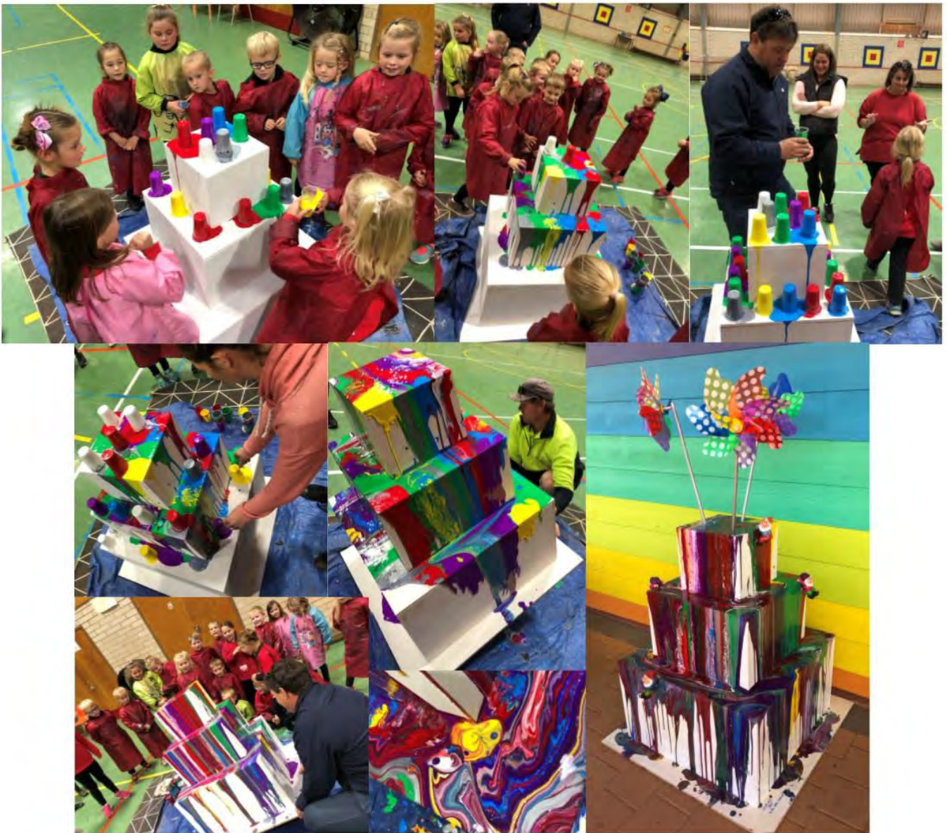
Sculpture can be viewed outside Jill's class.