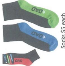
Socks $5 each