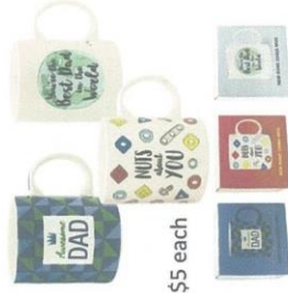
Cups $5 each