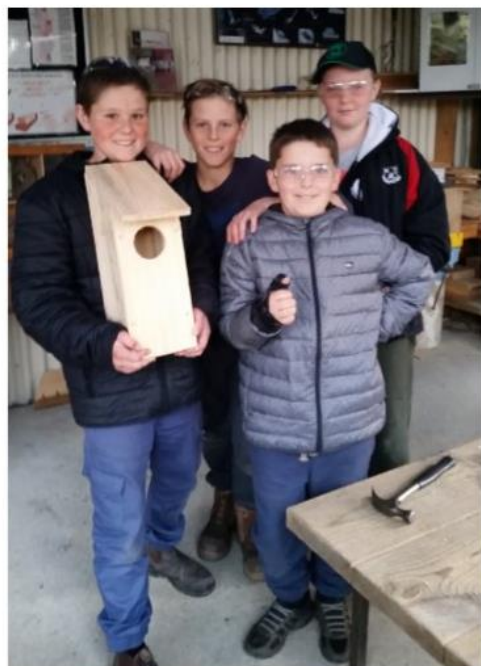
"I liked building nesting boxes at Arbury Park because I got to use a big hand drill."