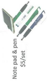
Note pad & pen $5/set