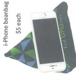
i-Phone beanbag $5 each