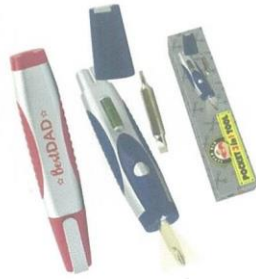
Pocket 3in1 Tool $5 each