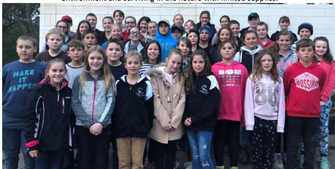
"Overall, I think that the camp was amazing! I loved relaxing and taking in a deep breath of fresh air. It was beautiful with green everywhere."