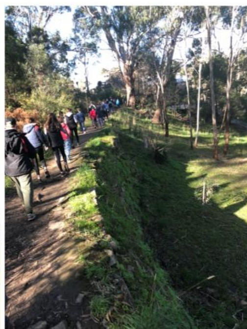
"I liked the Mt George hike because there was amazing views and we found out more about animals and wildlife."