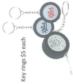
Key rings $5 each