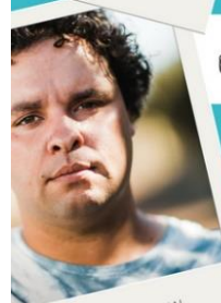
PRESTAGE, PORT LINCOLN