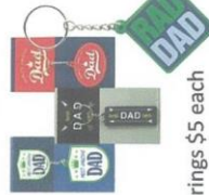
Key rings $5 each

Make sure you bring some money to buy Dad a special gift ready for Father's Day on Sunday 2 nd September