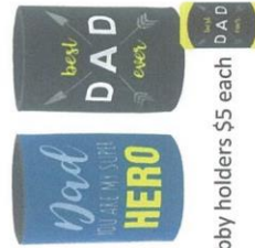
Stubby holders $5 each