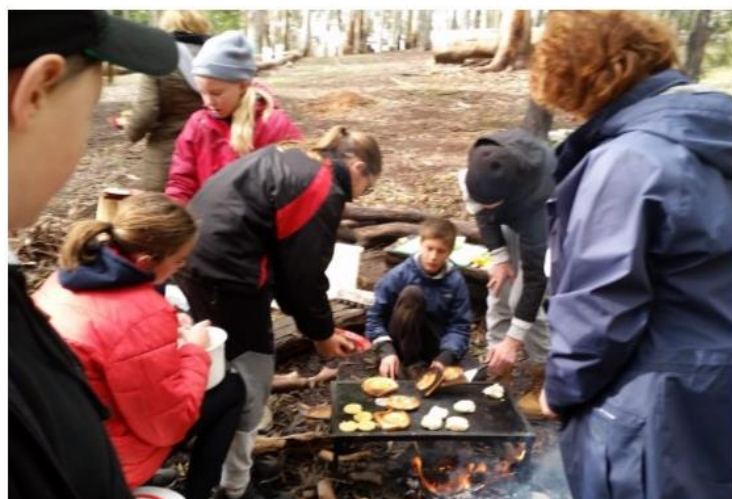
"I liked doing bush survival because we got to build shelter, eat damper and I learnt a lot about the environment and surviving in the nature with limited supplies."