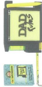
4 in 1 Tape Measure $5 each