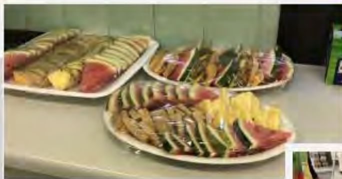
Preparing for a Stage 1 and 2 Group catering event— Roasting chickens, assembling platters.