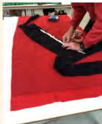
Remnant fabric project in process (Year 9)