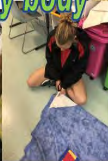
Re-purposing an old curtain for part of a surfboard cover