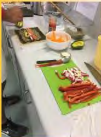
Trialling sushi using Quinoa