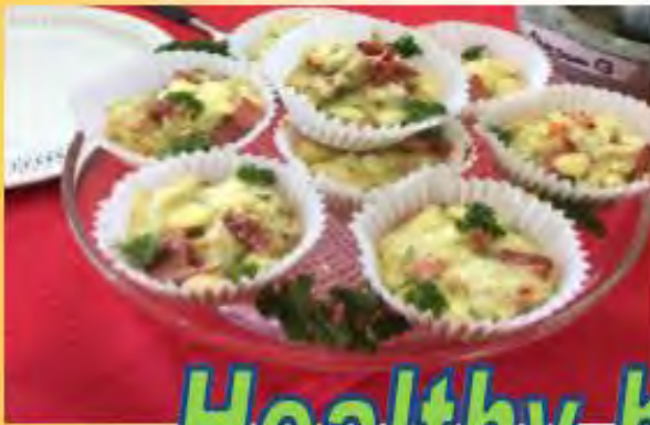
Mini Frittatas and assorted muffins—sweet and savoury using locally sourced eggs, zucchini and apples.