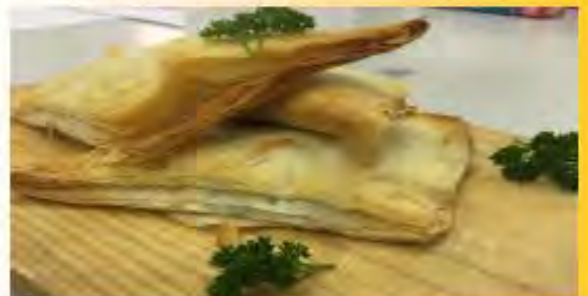
Healthy Cuisine: Greek (well mostly healthy)!